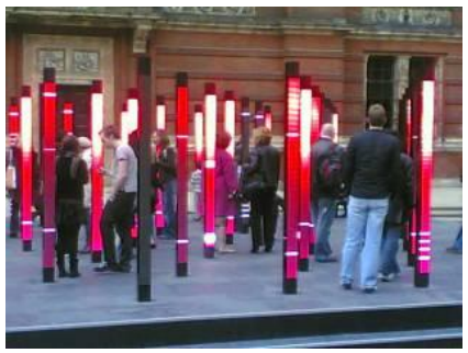
Supporting public engagement with interactivity: Volume by UVA London, 2007