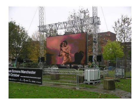
Outlet for art, Urban Screens Manchester, 2007