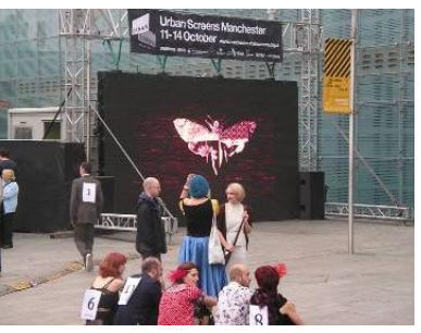
Dance contest, Urban Screens, Manchester, 2007

When taking into account the technical challenges the following aspects were identified: