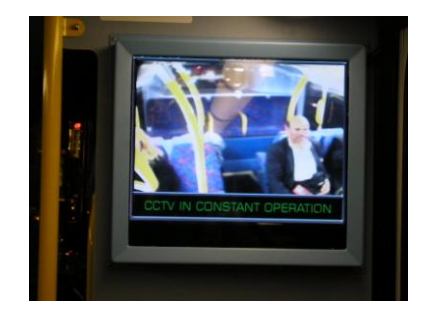
Direct messages for security reasons: Piccadilly Circus, London