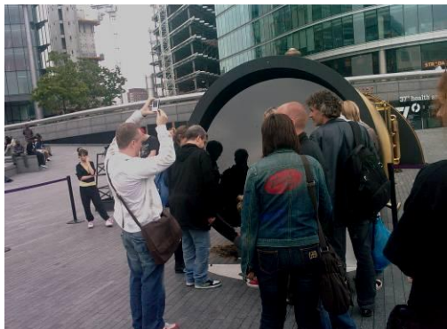
Connectivity: between London and New York, 2008