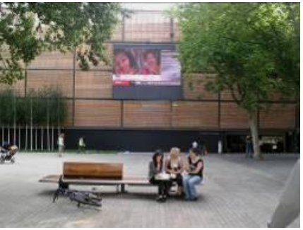
Regeneration: through a partnership between the BBC and the New Swindon Company Swindon, 2008