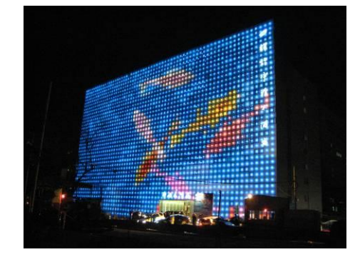
Green Pix, sustainable curtain wall in Beijing By Simone Giostra & Partners and Arup, 2008