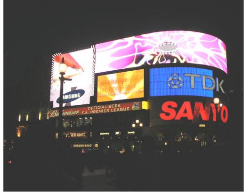
Commercial monologue: Piccadilly Circus, London